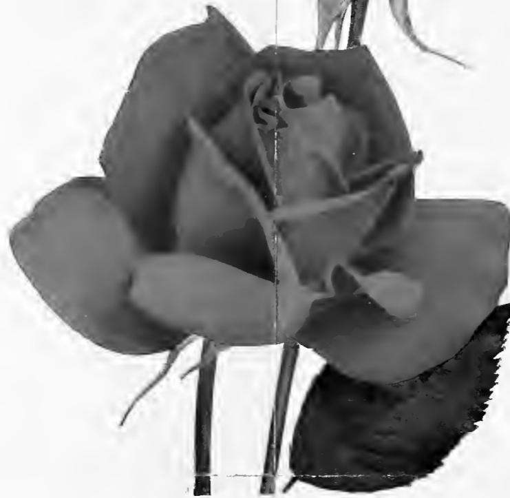
Etoile de Hollande

This new Yellow Rugosa hybrid is a very distinct shrub Rose. The flowers are double, clear light yellow, and are freely produced in spring and early summer. The foliage is utterly different from any other Rose. Makes a fine addition to the shrub border or an excellent specimen plant. We recommend it highly. $1.50 each, $13.50 for 10.